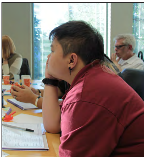
A CMC student listens closely during a ToP training session that was filmed for the video Technology of Participation .