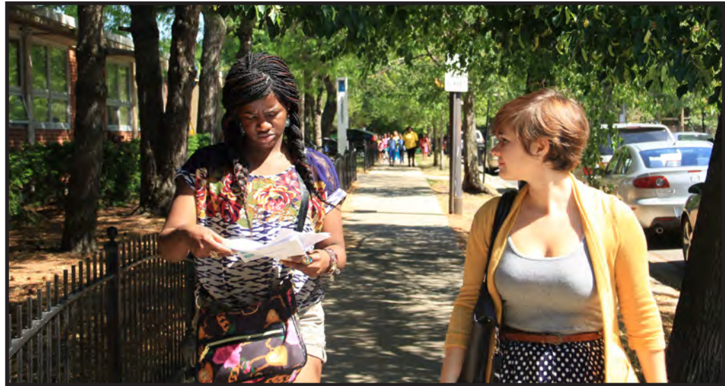
Summer interns make their way to a program on Chicago's South Side.

A total of 40 interns, joined by experienced colleagues, got down to the day-to-day work of getting ready for the Share