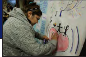
Page 4 - ToP and Youth