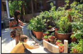
Page 3 - Service Learning