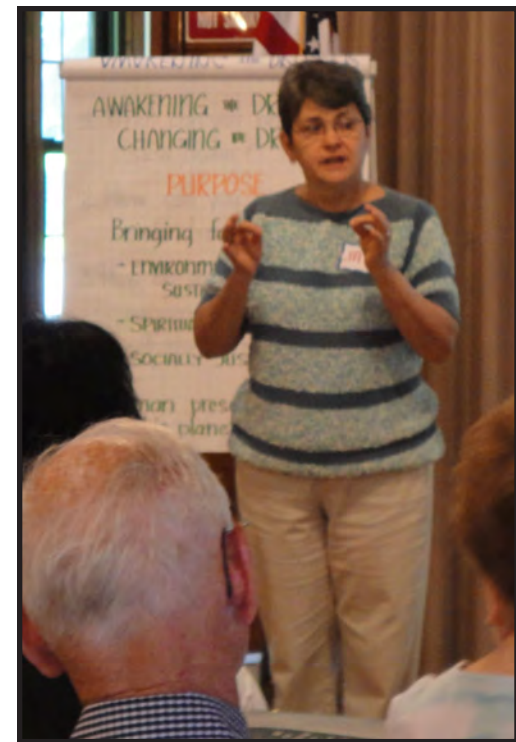
A facilitator speaks at the Ferguson, MO, symposium in May.

Those gathered discerned a few other local building blocks for the future: the