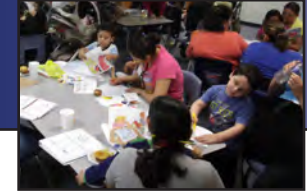
Page 5 - Learning Basket