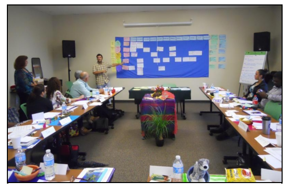
Workshop Method Training