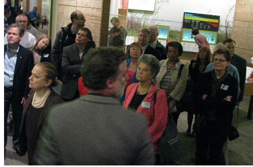
Members of the ICA Board and AC77 Advisory Committee listen during a tour of the Field Museum's new Restoring Earth exhibit.

The Institute of Cultural Affairs' (ICA) Board of Directors and the Advisory Committee for Accelerate 77 (AC77) met at The Field Museum in downtown Chicago on Friday, April 20, to hear updates on progress with the citywide project to connect community sustainability projects.